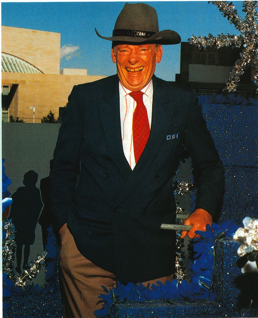
Herbert Kelleher '53

Herbert David Kelleher '53, despite being a New Jersey native educated at an elite Eastern school, is the "jan-you-wine" article, as one of his fellow Texans might twang it. The San Antonio resident is a no-bullshit straight-ahead kind of guy who has forced airline giants to fight on his terms. An